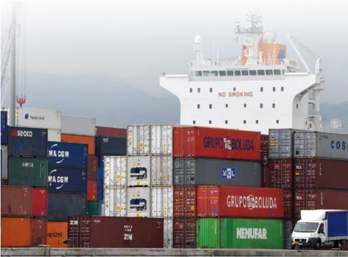
Data exchange standardisation for maritime surveillance is facilitated by the JRC, helping to improve cost effectiveness and maximise efficiency.

Namely, in its role as Technical Advisory Group Secretariat, the JRC will play a relevant role in the definition of the standard semantic related to the data exchanged within CISE and in the establishment of a suitable methodology for the maintenance of such standards to ensure the cross sector interoperability of the CISE over time.