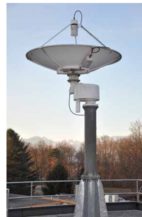
The Global Earth Observation System of Systems, supported by the JRC's INSPIRE initiative, proactively links together existing and planned observing systems around the world and supports the development of new systems where gaps currently exist.

JRC has led the development of approximately 25 draft INSPIRE data standards. These have been subject to stakeholder consultation. The comments and test reports involved 160 organisations in 20 countries.