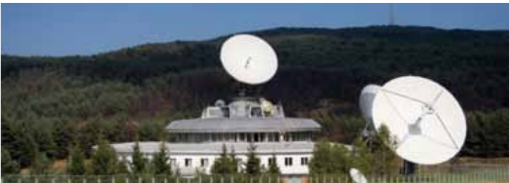
The JRC has conducted a study on the impact of a number of Global Navigation Satellite Systems (GNSS) on Galileo and vice versa, helping to guarantee radio frequency compatibility across the globe.

To-date, the radio-frequency compatibility tool has been developed and tested by the JRC. This has been followed by the first analysis on the interference between Galileo and GLONASS. The results have been verified against those obtained at ESA and UniBW. Simulation results have also been obtained for the GPS and COMPASS systems, and are currently being analysed and compared with the EGNOS and GLONASS results. Verification of simulation results is carried out through measurements in the JRC’s EMSL laboratory.