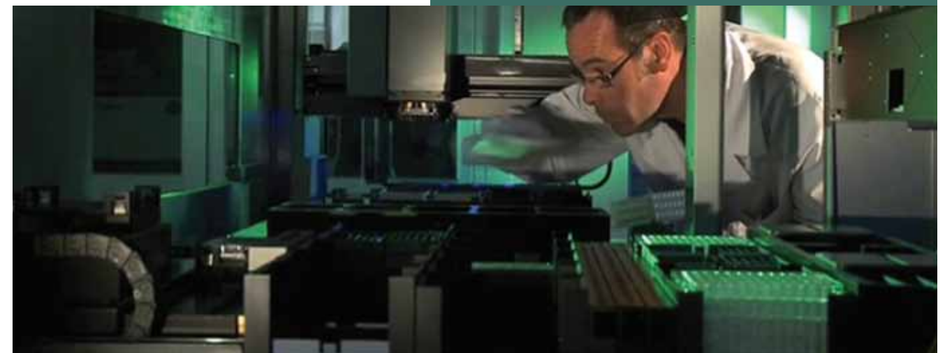
The JRC hosts the NANOHUB database, facilitating the exchange and collection of information on nanomaterials and products containing nanomaterials.

In January 2011, the JRC issued the first certified reference material from industry-sourced nanomaterials: ERM®-FD100 colloidal silica in water. In cooperation with other stakeholders, the JRC also studied several other representative nanomaterials of relevance for industry in view of their use in products and applications. Similarly, in October 2011, the Commission adopted Commission Recommendation 696/2011 on the Definition of Nanomaterial for regulatory purposes. The JRC has issued a reference report and contributed to the formulation of the recommendation. Meanwhile, another JRC reference report on requirements on measurements for the implementation of the European Commission definition of the term 'nanomaterial' is available.