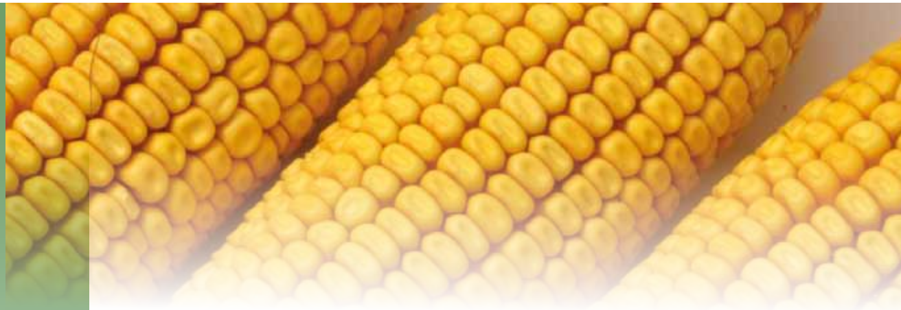
The European Union Reference Laboratories standardise method of analysis to ensure that the food we eat is safe.