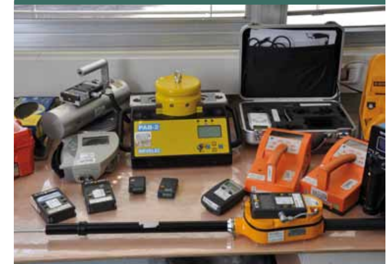
The Illicit Trafficking Radiological Assessment Program +10 (ITRAP+10), inaugurated by the JRC, tests commercially-available radiation detection equipment.

The Joint Research Centre is in the process of implementing a joint programme for the Commission's Home Affairs DG: the Illicit Trafficking Radiation Assessment Program+10 (ITRAP+10), which is carried out with the US Department of Homeland Security (DHS), Domestic Nuclear Detection Office (DNDO), Systems Engineering and Evaluation (SE&E). The purpose of ITRAP+10 is to conduct an evaluation and comparison of the performance of available radiation detection equipment relevant to nuclear security. The US Department of Homeland Security Domestic Nuclear Detection Office is mandated by Congress to set Technical Capability Standards, and implement a Test and Evaluation program, to provide performance, suitability, and survivability information, and related testing, for preventive radiological/nuclear detection equipment in the United States.