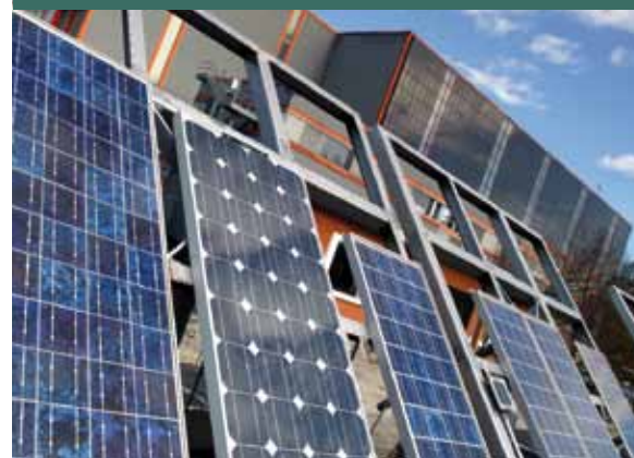
The European Solar Test Installation (ESTI) laboratory provides support to EU policies that will help enable the EU to meet its target of increasing renewable energy use to 20% of total energy consumption by 2020.

The recent upgrading of equipment and laboratories puts ESTI in a strong position to address expected standardisation issues accompanying the rapid expansion of the PV market. These include, for example, power calibration standards for thin film, concentrated PV, organic PV and other emerging products; extension of life-time guarantees up to 40 years; standard procedures for energy output rating etc. Pre-normative research and development will also serve the need to address the integration of PV in smart grids as well as in advanced concepts for building energy saving, in line with the EU goals in these areas.