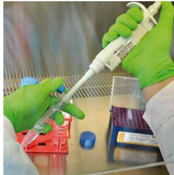
The JRC's research on in-vitro diagnostics provides policy advice and support to the In vitro Diagnostics Medical Device Directive (IVDD).

Currently JRC's pre-normative research and standardisation activities are directed towards new standards for the diagnosis and monitoring of selected cardiovascular diseases, chronic diseases, neurodegenerative diseases (e.g., Alzheimer) and autoimmune diseases. In parallel, the JRC facilitates the international harmonisation and global acceptance of reliable measurement systems via professional organisations (such as IFCC, collaboration with NIST) and standardisation bodies (ISO, CEN).