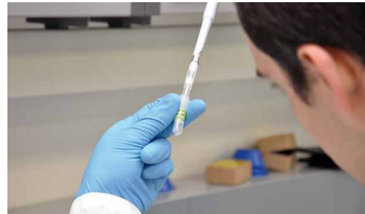
The European Union Reference Laboratories standardise method of analysis to ensure that the food we eat is safe.

The JRC is currently (2013) developing certified reference materials for independent calibration and quality control for the monitoring of GMOs in food and feed supplies. It leads discussions with biotech industry associations (EuropaBio and CropLife) to agree on a joint protocol defining the procedure for submission of validated methods to ISO for inclusion as international documentary standards. It is continuously working on the validation of GMO detection methods, in particular for the implementation of the new low-level presence legislation. New material standards were established in 2011 for sound reference measurement systems for GMO quantification, for example, in genetically modified potatoes. Guidance is also being developed for the harmonised implementation of the accreditation standard ISO/IEC 17025 for GMO control laboratories in the EU in cooperation with expert laboratories and the European co-operation for Accreditation (EA).