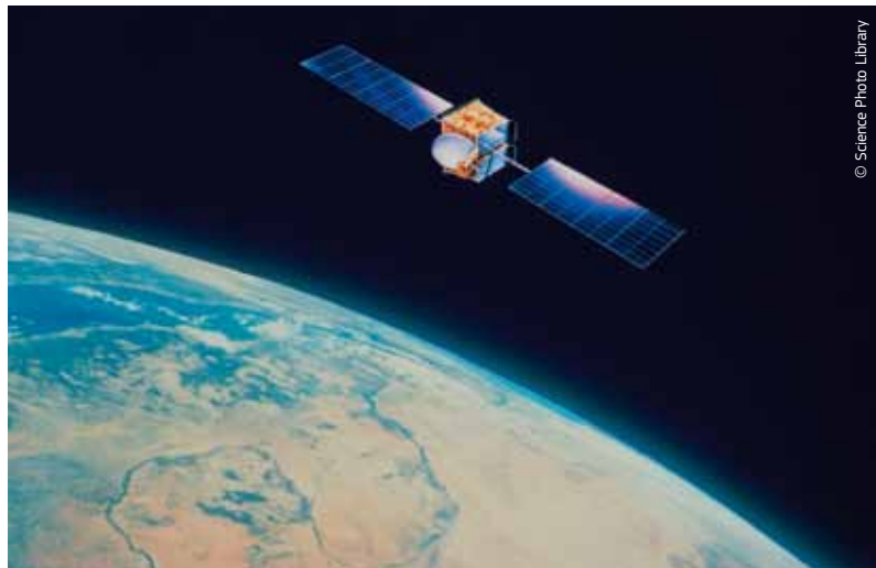
Within its earth observation research, the JRC maintains monitoring standards, and also provides trustworthy information in support of EU policy.

Within the framework of the Common Agricultural Policy checks programme, the JRC establishes guidelines for Member States on the use of remote sensing imagery for checking farmers' claims for CAP area-based subsidies. In particular, the area of claimed parcels is checked using Very High Resolution (VHR) imagery which imposes that this imagery should meet certain geometric quality standards. The JRC has recently tested Worldview-2 (Digital Globe, US), an example of a VHR sensor which offers a 0.5m ground sampling distance fitting the CAP checks accuracy needs. The JRC continuously benchmarks sensors ensuring that geometric accuracy thresholds are maintained, specifying which elevation angles and number of ground control points (GCPs) are used. The JRC is currently benchmarking Pleiades1a and SPOT6; both Astrium, produced in France.