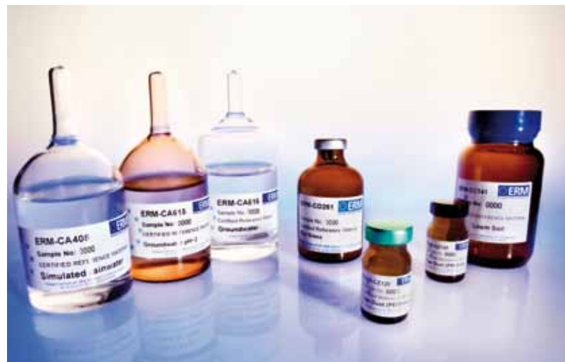
Certified reference materials allow for reliable and comparable environmental monitoring.

Besides the more traditional analytes with ecotoxicological relevance, such as heavy metals and persistent organochlorine pollutants, there is increasing interest in the fate of substances such as endocrine disruptors, brominated flame retardants, chloroalkanes and drug residues in the environment. Accordingly, the JRC's development programme for certified reference materials is tailored to meet the new and emerging needs of European legislation.