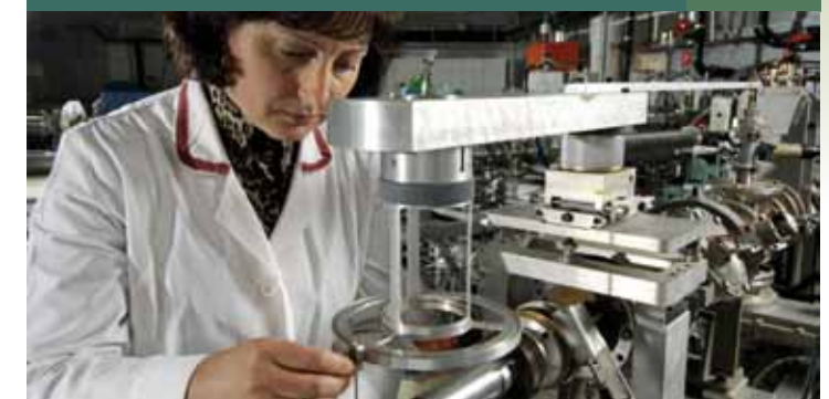
A JRC scientist sets up an experiment for measuring neutron cross sections

The JRC's facilities play a key role in the measurement of nuclear data standards. Reference measurements at both facilities substantially contributed to the successful new evaluation of the unique neutron cross section standards file lead by the IAEA. This standard file is used by all international nuclear data evaluation projects, e.g. the evaluated nuclear data file (ENDF) used in the USA, the European joint evaluated fusion and fission (JEFF) file, and the Japanese evaluated nuclear data (JENDL) to name a few. A new nuclear data development project has recently been approved by the IAEA. It is focused on neutron cross-section standards that will be up-to-date when they are needed by the various nuclear data evaluation projects.