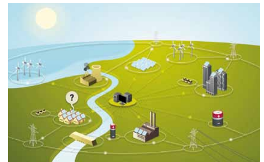
Smart grids are intelligent electricity systems enabling sustainable, economically viable and secure energy supplies.

In November 2011, the JRC and the United States Department of Energy (DOE) signed a Letter of Intent to establish two Scientific Interoperability Centres, one in Europe located at the JRC's sites in Ispra (Italy) and Petten (the Netherlands), and one in the US, at Argonne National Laboratories. These reference centres are working to ensure that hardware and software, including communications used in the EU and in the US, are interoperable, and aims to facilitate innovation, manufacturing and trade to support economic growth and job creation in the transatlantic context.