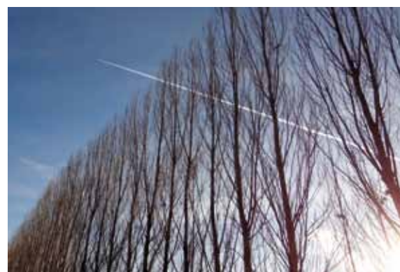
The European Security Label subjects security products and services to certain standards – in aviation security for example – that allow for greater protection of the citizen.

In parallel, the European Standards Organisations the European Committee for Standardisation (CEN) and the European Telecommunications Standards Institute (ETSI) have been given a programming mandate for standardisation in the context of security. The JRC has been requested to provide active support to this initiative.