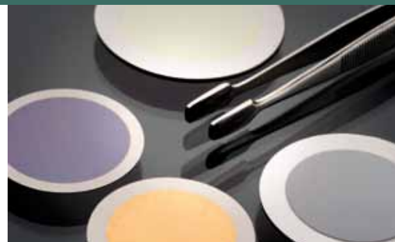
Target preparation for nuclear data measurements, used in research that helps support the Euratom Treaty.

The JRC operates radionuclide measurement facilities which serve to harmonise the radioactivity measurement system in the EU and globally, at all levels from the basic realisation of the unit for activity (Becquerel) to safety- and security-relevant applications in nuclear decommissioning, environmental monitoring or surveillance of foodstuffs.