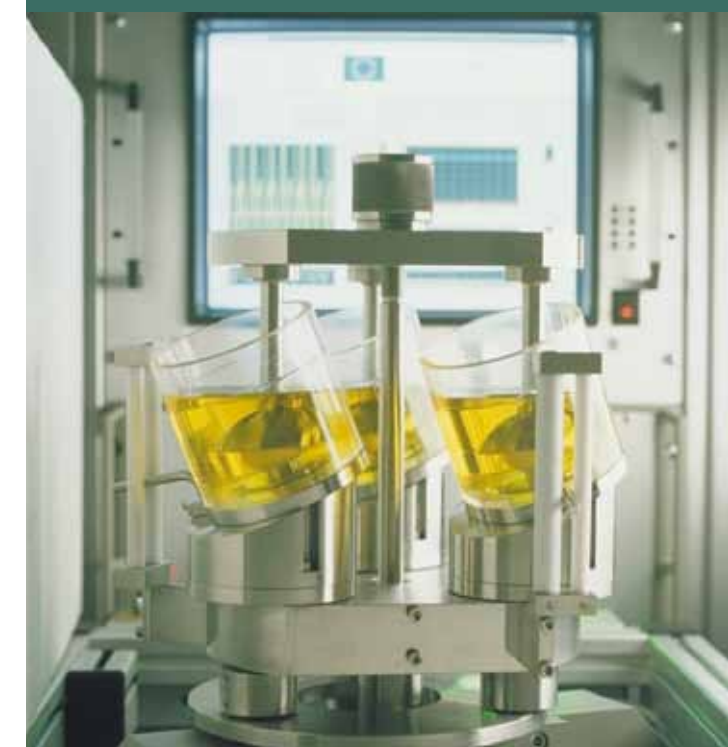
The European Union Reference Laboratory for Alternative Methods to Animal Testing (EURL ECVAM) helps to validate and standardise alternative methods.

Applying a novel approach, the EURL ECVAM has demonstrated for the first time how an automated robotic in vitro testing platform can be used to generate the data needed for the purposes of validation, in a rapid and precise manner. This "high throughput" validation approach is expected to expedite the screening of promising assays to identify the high-performers that should be taken forward for further assessment.