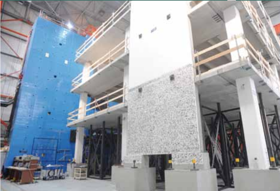
The European Laboratory for Structural Assessment (ELSA) is capable of testing the behaviour of buildings of up to five storeys high when exposed to earthquakes.

At its European Laboratory for Structural Assessment (ELSA), the JRC recently tested a full-scale four-storey reinforced concrete building designed for gravity loads and achieved a fivefold increase in seismic load capacity after retrofitting, by infilling the central bay with a reinforced concrete wall. This cost-effective technique is commonly used in southern Mediterranean European countries exposed to seismic risk for the upgrading of existing, highly vulnerable buildings designed in the 1960s and 1970s with insufficient seismic capacity. The methodology for enhancing capacity was developed by the Cyprus University of Technology through an FP7 integrated project SERIES. The application of such techniques for seismic rehabilitation provides a significant contribution to sustainability, as it avoids demolition and waste disposal, extending the life of existing buildings with a direct impact on reducing the consumption of energy and natural resources. The results from the test campaign carried out at the JRC will result in design guidelines for their future incorporation in the EUROCODES.