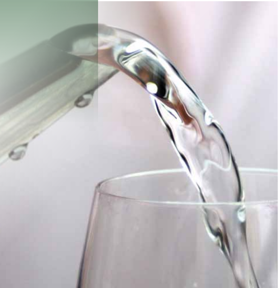
The Water Framework Directive aims to classify all European surface water from high to bad quality, and harmonisation and standardisation research at the JRC actively supports this initiative.

First results were published in 2008 and further results were completed in 2013. EU member states are using the results of the intercalibration work to prepare and implement their river basin management plans. These plans identify waters that do not achieve the environmental objectives set out in the directive, along with the measures necessary to improve conditions and reach good status. Intercalibration thus plays a crucial role in identifying where action is needed to restore the quality of Europe's waters.