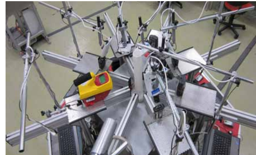
Reference instruments used to record data in parallel to instruments under testing as part of ITRAP+10.

The European Committee for Standardisation (CEN), European Committee for Electrotechnical Standardisation (CENELEC), and the JRC will work together with the aim to promote a cost-effective way of taking into account the CLC/TC45AX standards in European Union countries.