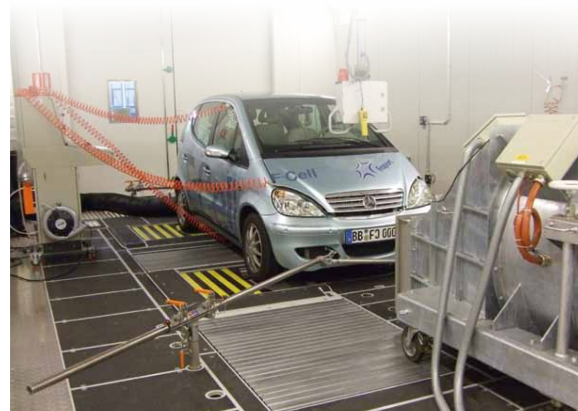
A fuel cell vehicle undergoing testing at the JRC's Vehicle Emissions Laboratory

Together with US Department of Energy, JRC co-chairs the Regulations, Codes and Standards Working Group of the International Partnership for Hydrogen in the Economy (IPHE). Within this working group, JRC and Sandia National Labs collaborate to assess the feasibility of a number of requirements that will be included in the forthcoming UN Global Technical Regulation on hydrogen fuelled vehicles. This feasibility evaluation covers specifically testing of on-board composite tanks for storing hydrogen under pressures up to 700 bar, as well as the performance criteria that testing infrastructure (hardware, control and measurement equipment) has to meet to ensure worldwide consistency and comparability of hydrogen high-pressure testing in type-approval schemes.