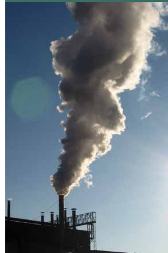
The JRC plays a key role in supporting EU legislation, such as the Industrial Emissions Directive.

In 2012, the first two implementing decisions on the best available techniques (BAT) conclusions on industrial emissions were adopted by the Commission. They referred to the iron and steel production and glass manufacture. These conclusions define the reference for setting the permit conditions for these installations in Europe under the new Industrial Emissions Directive (IED) 2010/75/EU. Given the techno-economic and scientific nature of the BREFs as well as the very sensitive nature of their conclusions, they are elaborated by the JRC's European IPPC Bureau, which fulfils an obligation of the Commission (as laid down in Article 13(1) of the IED) to 'organise an exchange of information between EU member states, the industries concerned, non-governmental organisations promoting environmental protection and the Commission'. The objective is to draw up, review and, where necessary, update the BAT reference documents (BREFs). The European IPPC Bureau steers the work on determining BAT, guided by the principles of technical expertise, transparency and neutrality. Its work entails the independent verification and analysis of the information collected to derive BAT conclusions.